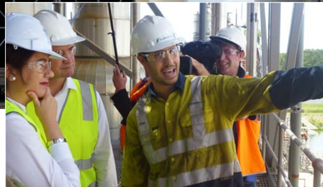
Queensland Premier Anastacia Palaszczuk MP tours the site for the pilot plant

Southern Oil continues to drive innovation in this space, and has partnered with the Queensland University of Technology to fund research into the production of industrial products from by products generated during biofuel and recycled oil production.